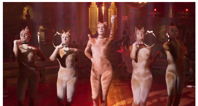
What we got

Fun fact: "Cats - A Look Inside" was released a day before the actual trailer and it didn't have any CGI at all.