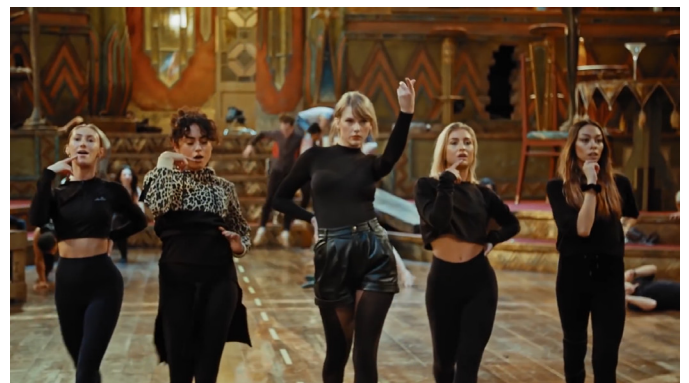
What we were promised

We've saved the biggest flaw for the last, the CGI. To be completely honest, the movie would've looked better before the special effects were added.